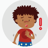
Fast breathing or long pauses in breathing