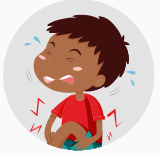
A lot of pain or very restless