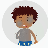
Blotchy, blue or pale skin