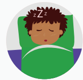
Drowsy, difficult to wake up, irritable or confused