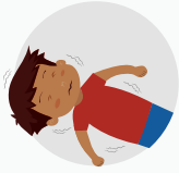
Fit or seizure