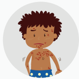
Rash that doesn't fade when pressed