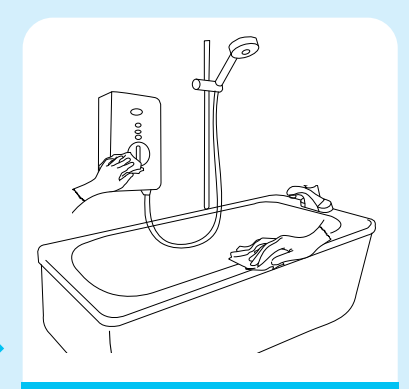
Baths and showers