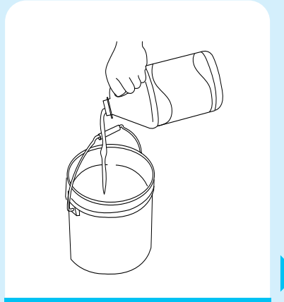
Add to a bucket of water (use gloves if you can)