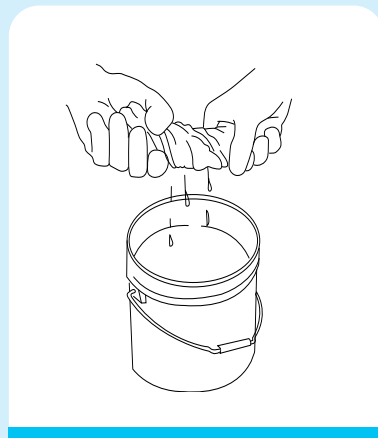
Wet and wring out wash cloth