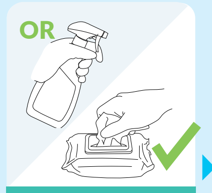
Use a spray cleaner or Surface wipes