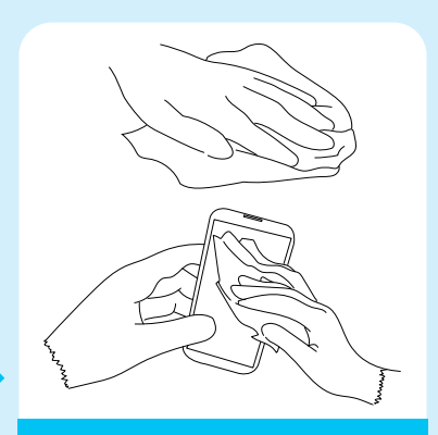
Wipe all surfaces and phones