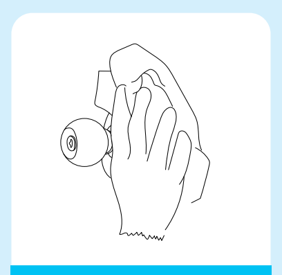
Doors and handles