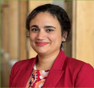
Hon Lauren Moss MLA

Minister for Mental Health and Suicide Prevention