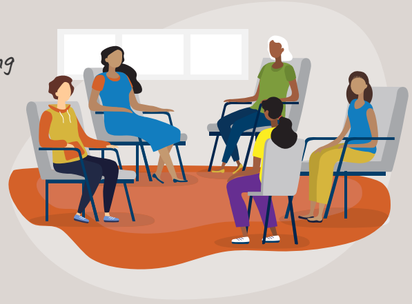
Table 9 | What we will do to implement Action Area 6