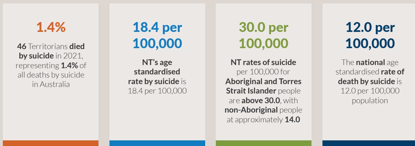
Figure 1 | Statistics involving suicide in the NT 2021

Suicide prevention is everyone's responsibility. It is up to everyone to do what they can to support each other, and to reach out to others in times of disruption and distress. Some significant statistics involving suicide in the NT have been outlined in Figure 1.